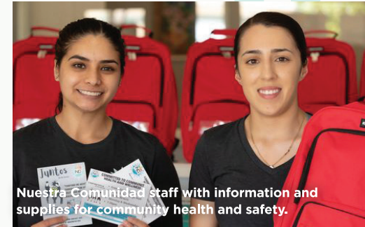
Nuestra Comunidad staff with information and supplies for community health and safety.

Read more about this effort at healthcarefoundation.net/CRT