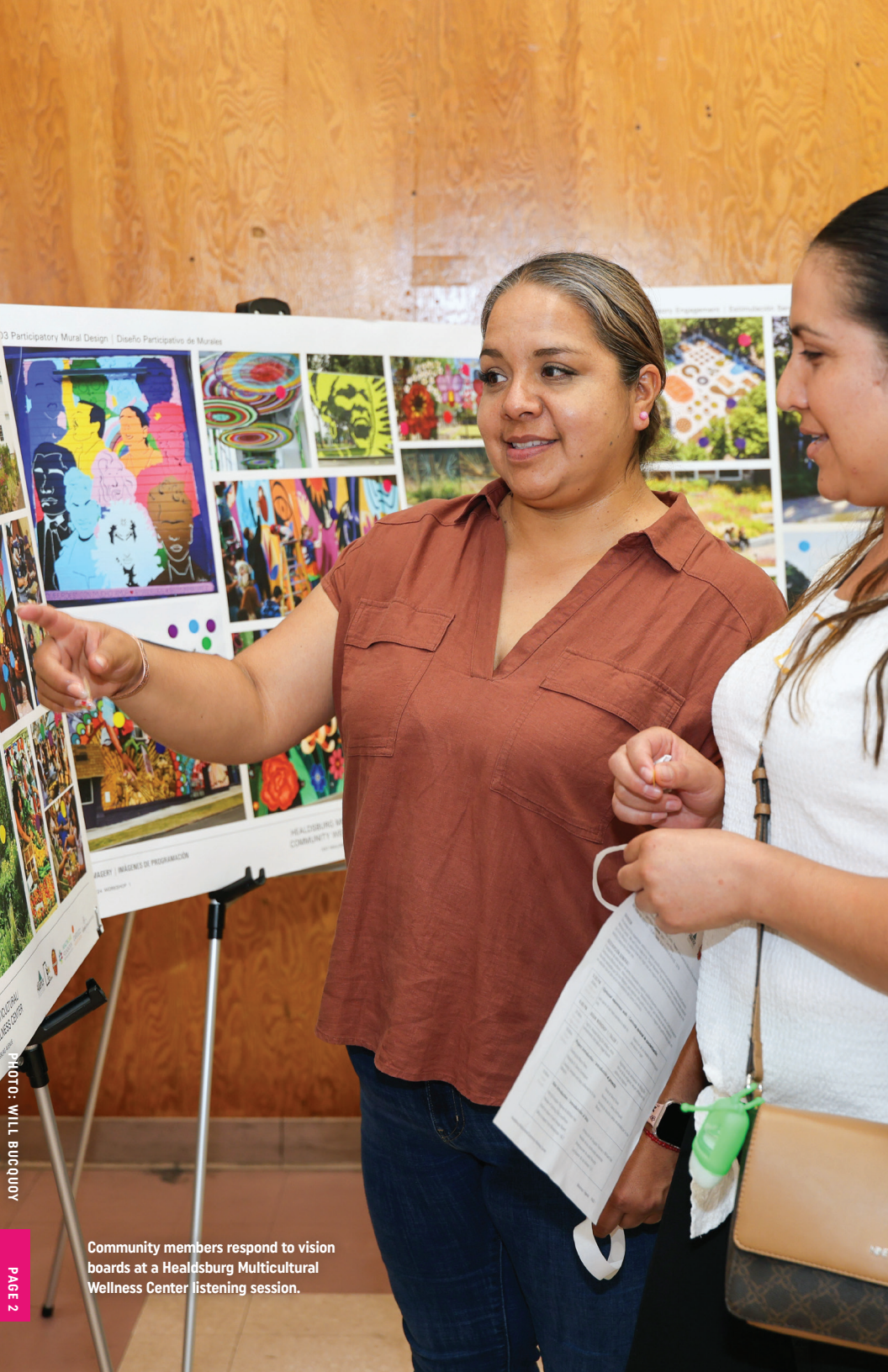
Community members respond to vision boards at a Healdsburg Multicultural Wellness Center listening session.