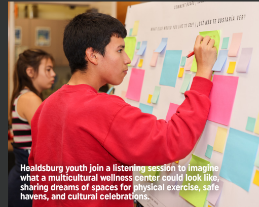
Healdsburg youth join a listening session to imagine what a multicultural wellness center could look like, sharing dreams of spaces for physical exercise, safe havens, and cultural celebrations.

Discussions so far have stressed a desire for wellness services and programs, access to mental health services, and learning opportunities for adults that were also kid-safe spaces for parents. “Safe” kept coming up,” she notes. “Security. Making sure folks feel welcome.”