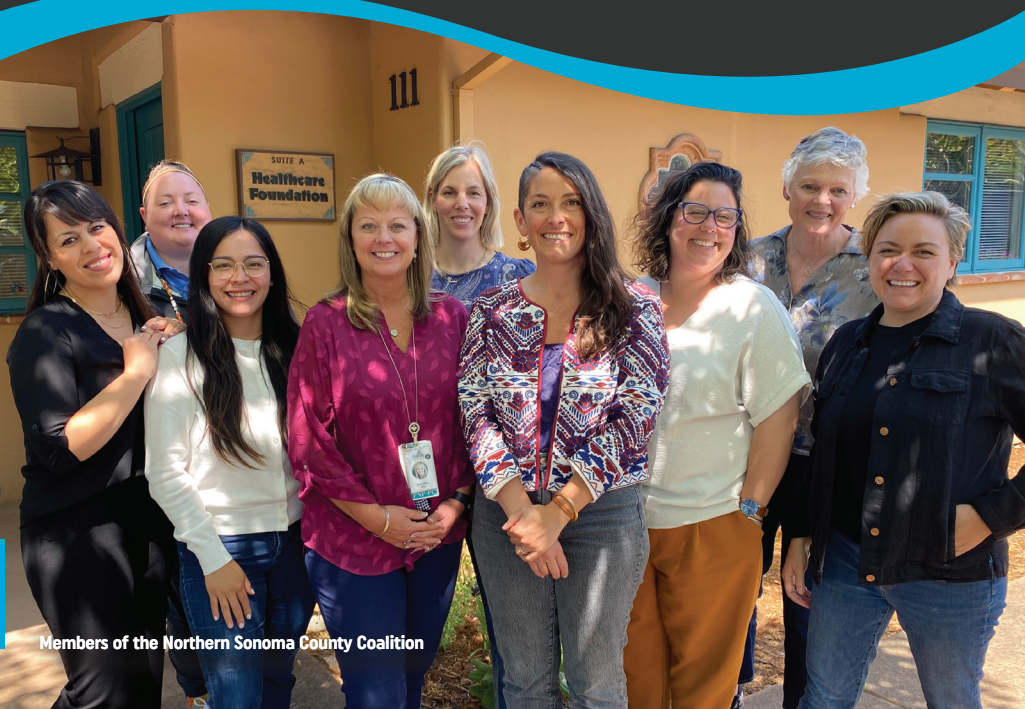
Members of the Northern Sonoma County Coalition

By empowering local providers to sustainably bill for essential services, the Coalition is not only stabilizing individual agencies, but also weaving a more integrated, equitable, and resilient safety net across northern Sonoma County—an approach that can serve as a model for communities statewide.