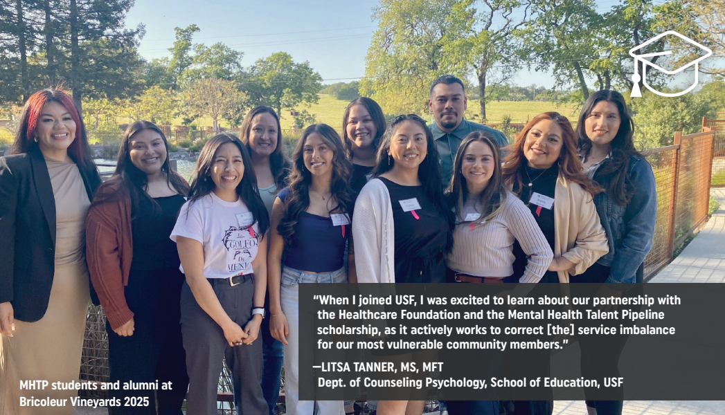
MHTP students and alumni at Bricoleur Vineyards 2025

"When I joined USF, I was excited to learn about our partnership with the Healthcare Foundation and the Mental Health Talent Pipeline scholarship, as it actively works to correct [the] service imbalance for our most vulnerable community members."