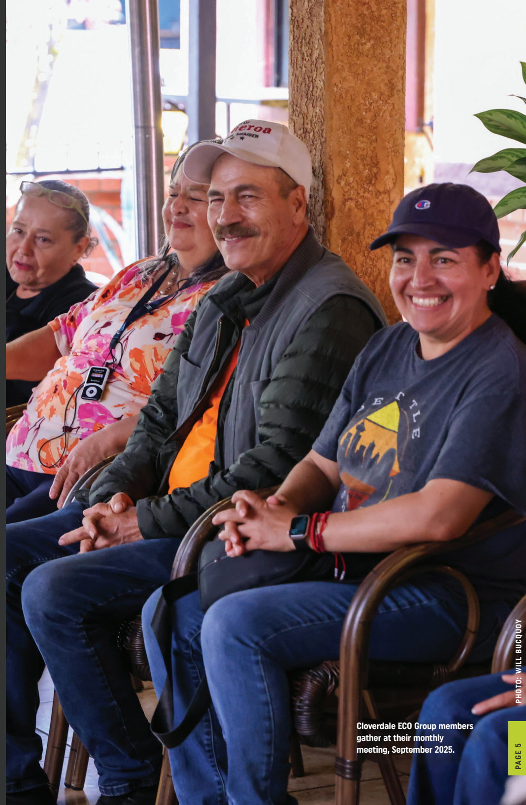
Cloverdale ECO Group members gather at their monthly meeting, September 2025.

Through its community-led and community-building design, the ECO Group not only addresses key drivers of poor health outcomes but also empowers elders with a collective voice in shaping solutions for a healthier, more connected Cloverdale.